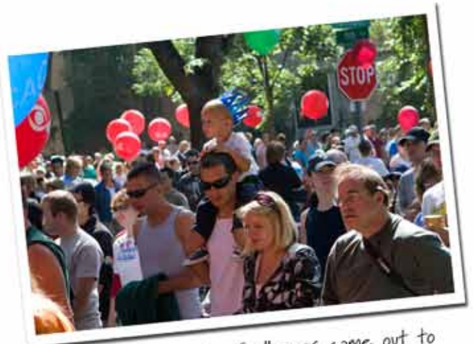
Over 7000 people of all ages came out to support our work at AIDS Walk Colorado!

AIDS Walk Colorado is the Rocky Mountain Region's largest and most successful HIV and AIDS fundraiser. More than 7,000 people from throughout the state came together for the 21st annual AIDS Walk Colorado and the 3rd annual AIDS Run Colorado, fueled by donations from more than 13,000 individuals, to raise money for vital services for HIV/AIDS clients of Colorado AIDS Project and more than 30 other outstanding AIDS service organizations. The event served as a day to remember those we have lost to the disease with prominent speakers including Denver Mayor John Hickenlooper. The event also included panels of the AIDS Memorial Quilt, in addition to live music, vendors, food and beverages.