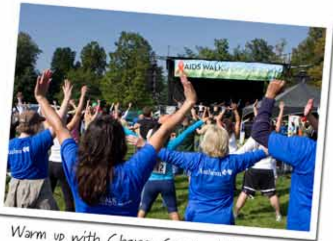
Warm up with Cherry Creek Athletic Club