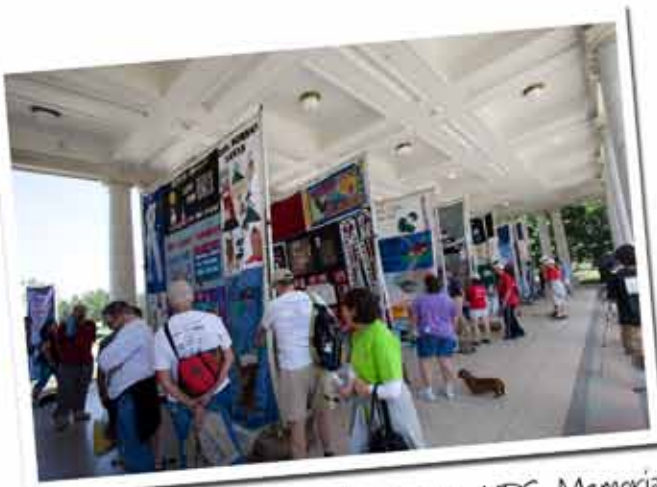
Participants explore panels of the AIDS Memorial Quilt, remembering why we Walk